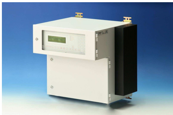
Front FE IP65